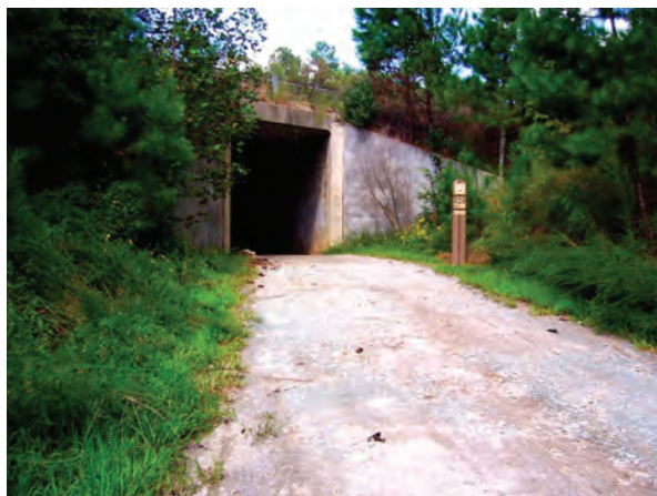
Tunnel under Highway 64

Wake County's portion of the American Tobacco Trail (ATT) offers a quiet and rural setting traversing 6.5 miles from the community of New Hill in southern Wake County to the Chatham County line. Public access points are located off New Hill-Olive Chapel Road, Wimberly Road and White Oak Church Road. The trail is open to walkers, runners, bicyclists and equestrians. Restrooms and horse trailer parking are provided at the New Hill-Olive Chapel and White Oak Church Road access areas. The ATT project includes converting the abandoned railroad into a multi-use trail that covers 22 miles from New Hill to Downtown Durham.